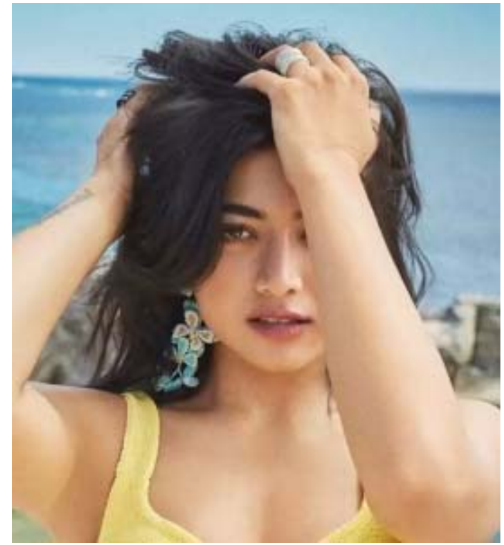
rently filming for "Pushpa 2", "The Girlfriend", "Chhava" and "Kubera". After the massive success of her Bollywood film "Animal", Rashmika Mandanna emerged as one of the biggest female stars in Indian cinema.

Going by Rashmika's video message, it looks like she is unofficially became a part of Bharatiya Janata Party's political campaign for this election season. So, naturally, BJP followers praised her for such a positive video message and supporters of opposition parties are trolling her for being a part of BJP's paid batch. Some say, she did this under pressure from the ruling BJP government. Despite dividing opinions, Rashmika Mandanna has now become a trending topic on social media. She is cur-