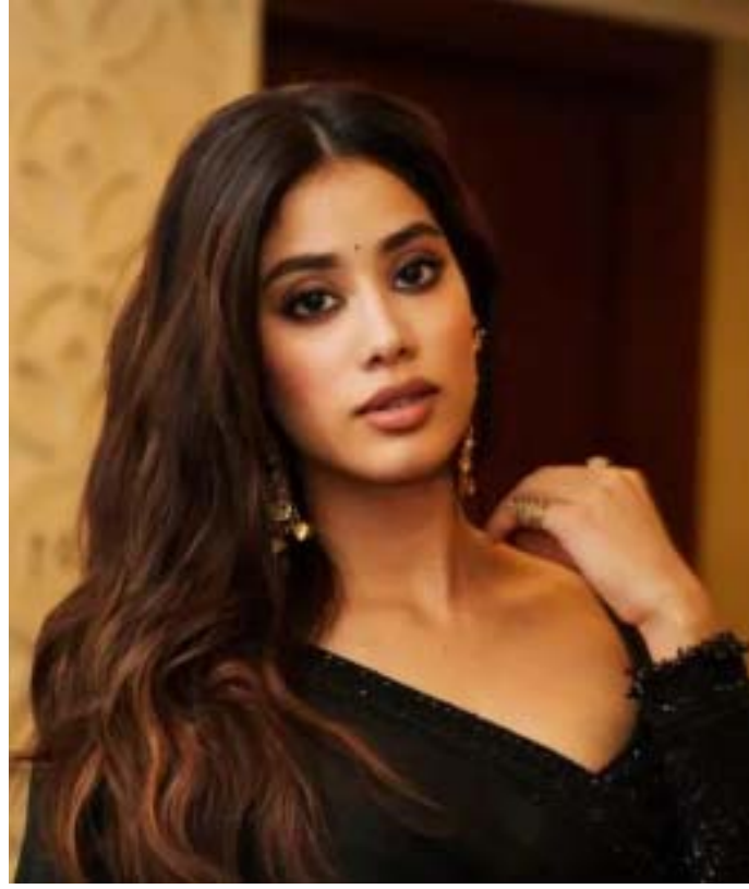
Janhvi Kapoor and Rajkummar Rao following their successful venture in Roohi . Originally scheduled for an April release, the sports drama is now slated to hit theatres on May 31, 2024.