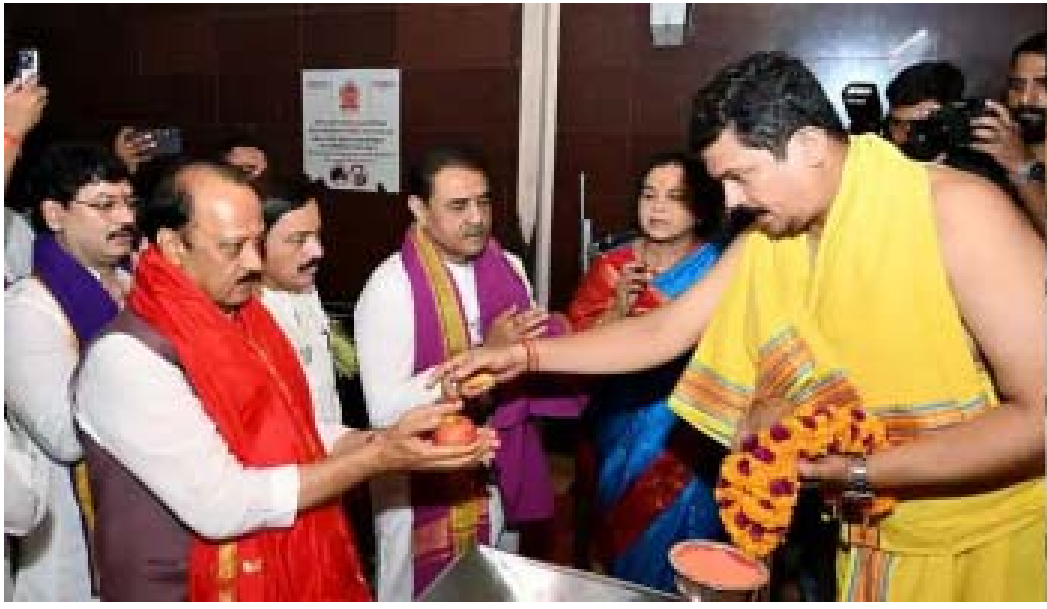
Maharaj palkhis to Pandharpur.